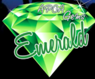
Emerald: 5 Years Continuous Membership