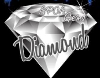
Diamond: 15 Years Continuous Membership