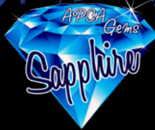
Sapphire: 10 Years Continuous Membership